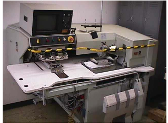
ADLER 805-121103 FOR SHIRTS