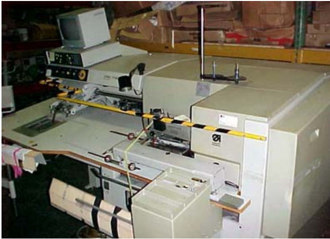
ADLER 805-121103 STRETCH MODEL FOR SHIRTS