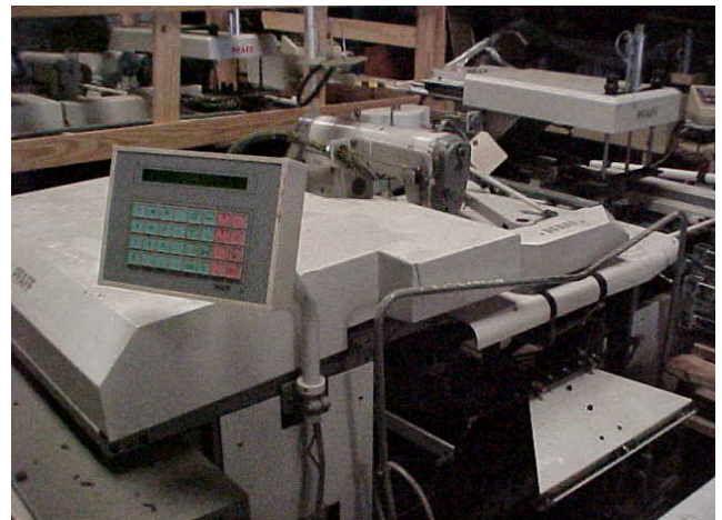
PFAFF 3568-2/12 FOR JEANS