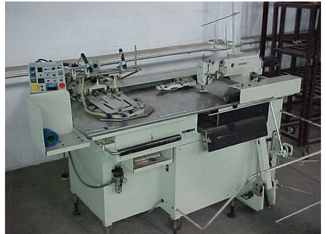
BROTHER BAS-760 FOR JEANS