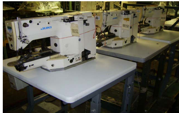
JUKI LK-1852 LOCKSTITCH BUTTON SEW