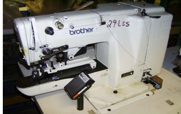
BROTHER B438, LOCKSTITCH BUTTON SEW