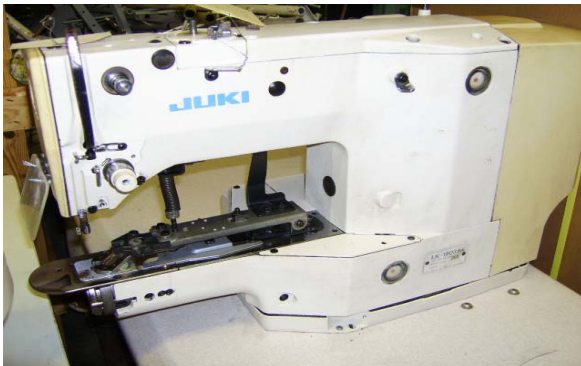
JUKI LK-1903 ELECTRONIC BUTTON SEW