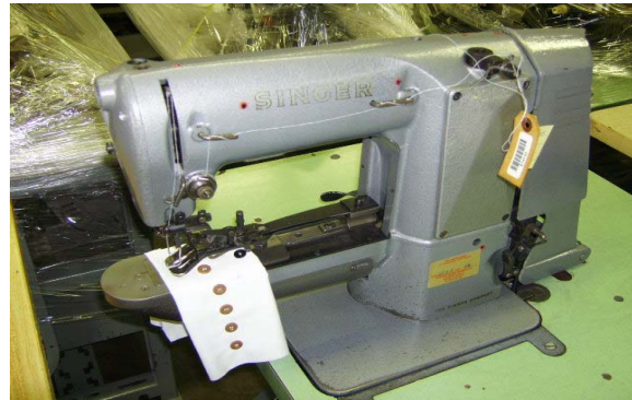
SINGER 269, LOCKSTITCH BUTTON SEWER