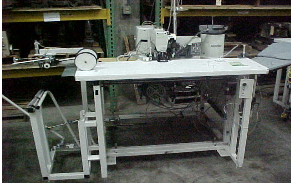
BROTHER B448/BA15/BECKER INDEXER