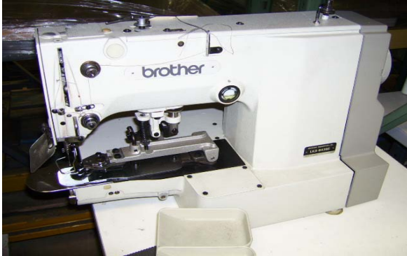
BROTHER B438E ELECTRONIC BUTTONSEW