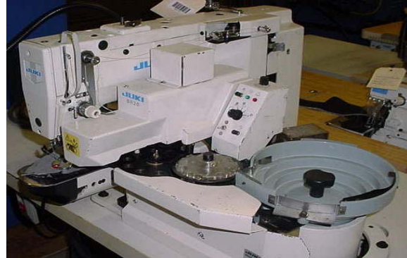
JUKI LK-1852/BR20 BUTTON SEW W/ROBOT